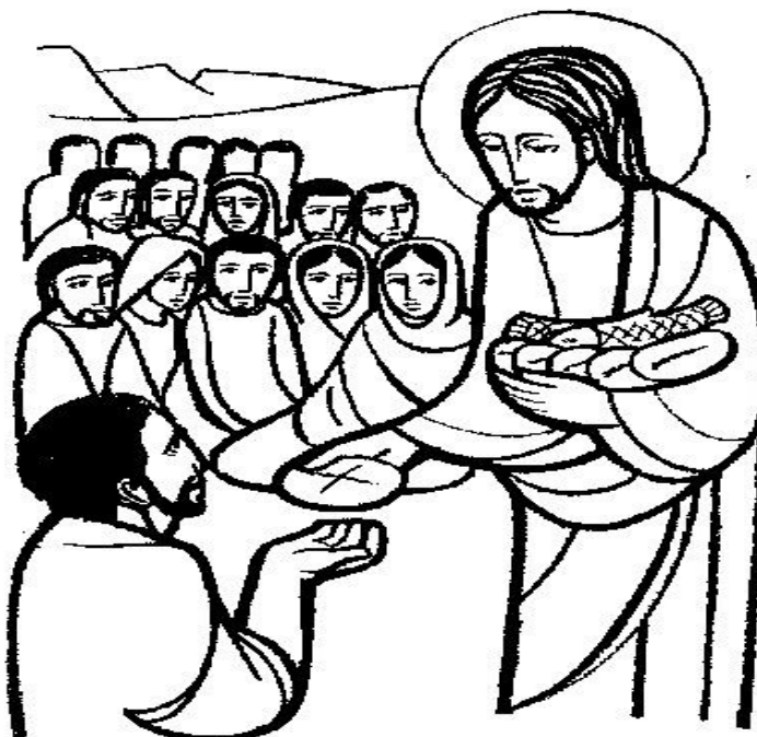
Christ who feeds us

Jesus said to Philip: 'Where can we buy some food for these people to eat?' In spite of all the riches of our world, countless people die each year of starvation. We can feel totally helpless in the face of this and as a result we ignore it. Generosity is one of the great virtues of our people over the generations and is one that we need to practice in a special way today. But there are other hungers that we can do even more about and Jesus is calling on us to attend to these also. One of the greatest human hungers is for love and affection. This may be in our own close relationships of marriage and family life. There is also the hunger in so many people in our community today for someone to look out for them. That is a must if we are to be a true community of faith in the parish.